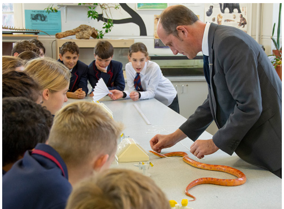
Reptile Society: meet Red, one of the seven rescue snakes kept in the Science Block